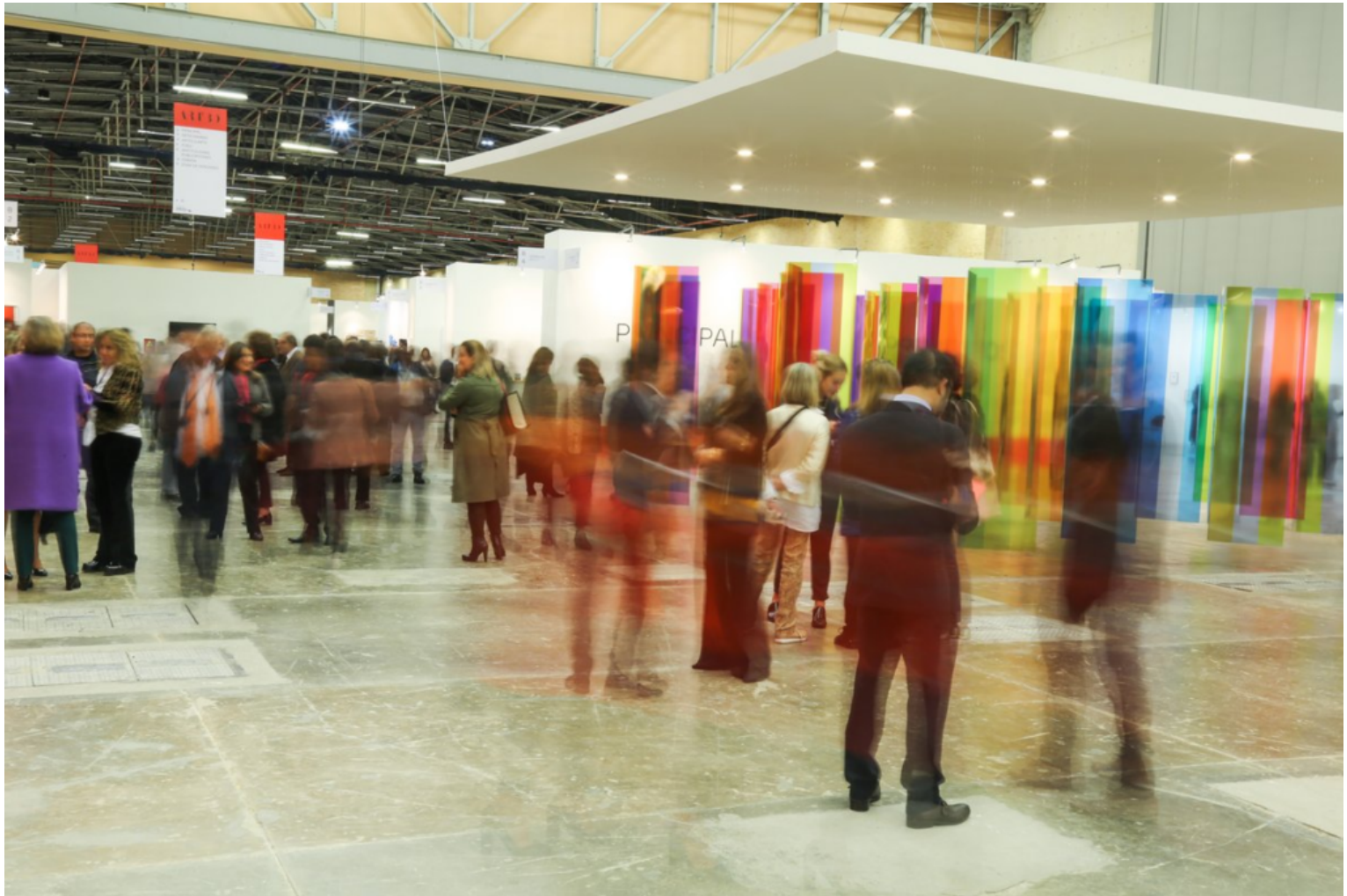
A view of the opening days of ARTBO's 15th anniversary edition.

Brian Boucher ( https://news.artnet.com/about/brian-boucher-244 ), September 20, 2019